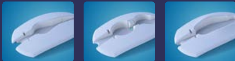
OP1000: InvisiShunt® 1 | OP2000: InvisiShunt® 2 | OP3000: InvisiShunt® 3 | OP4000: InvisiShunt® 4 | OP5000: InvisiShunt® 5