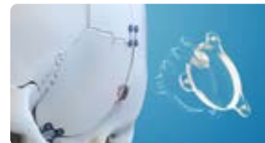
171705: 3cm ClearFit® Cover | 171706: 2cm ClearFit® Cover | 171707: 2cm ClearFit® Cover w/ Slot