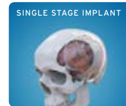
SINGLE STAGE IMPLANT